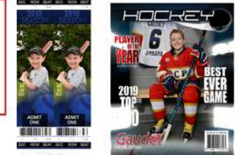
2- Tickets $10.00 M. Magazine Cover $15.00