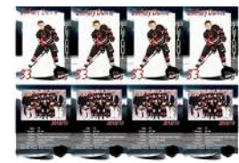
Trader Cards Double sided